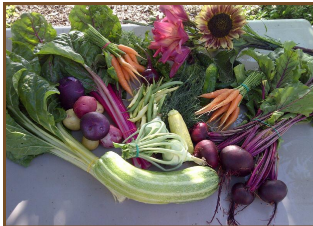
Full Share end of July

How much food can we expect to get? Living in Southern Alberta with volatile weather patterns this can be a difficult question to answer. Share volumes will be dictated by what we are able to produce. The approximate target for full share (a conservative guess for the total season): beets 10-15 lbs, carrots 6-8 lbs, cucumbers 25 – 35 fruit, beans 4-5 lbs, green onions 25, lettuce / spinach 1-2 bunches / week for 6 weeks, peas 3-4 lbs, potatoes 20 lbs, pumpkins 3-4 fruit, summer squash 15-20 fruit, tomatoes 5-10 lbs, various herbs when in season. In a CSA arrangement, the farmer and the shareholder “share” the risks associated with unpredictable weather. But, know that we will do everything we can to bring plenty of quality produce to you on a weekly basis throughout the growing season.